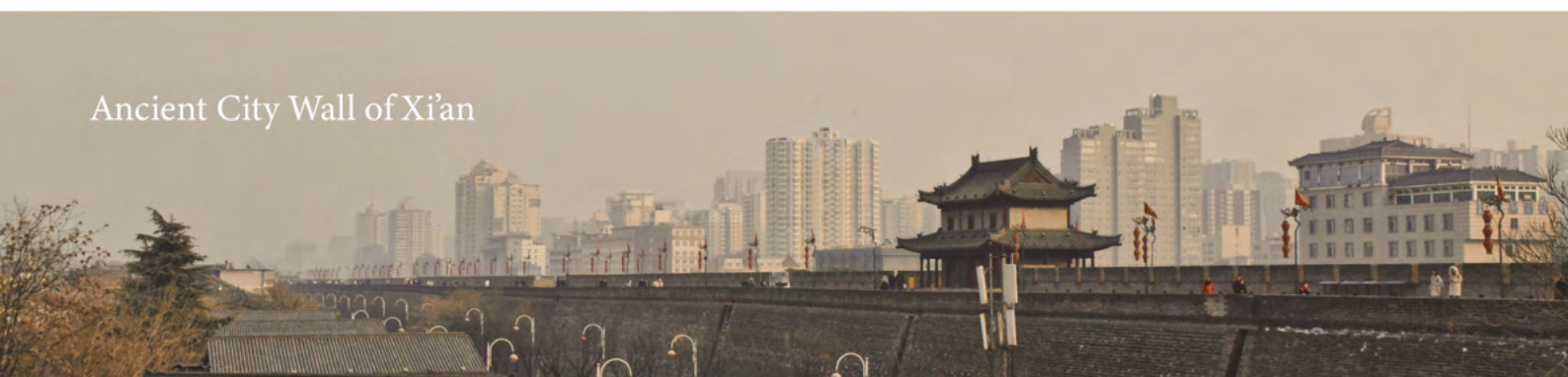
Ancient City Wall of Xi'an