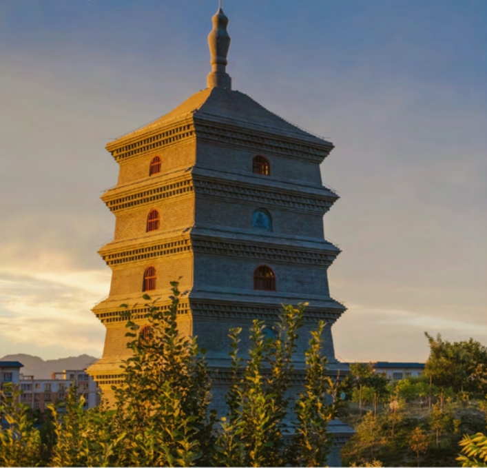
Giant Wild Goose Pagoda Square