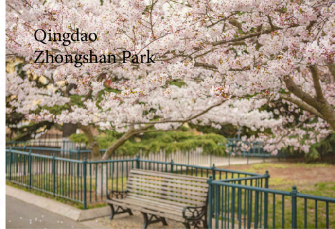
Qingdao Zhongshan Park