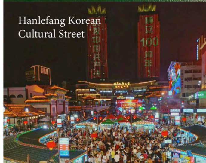
Hanlefang Korean Cultural Street