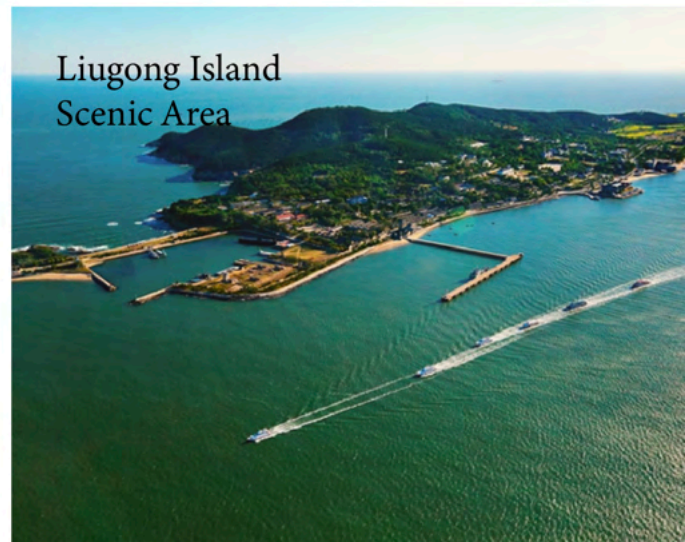
Liugong Island Scenic Area