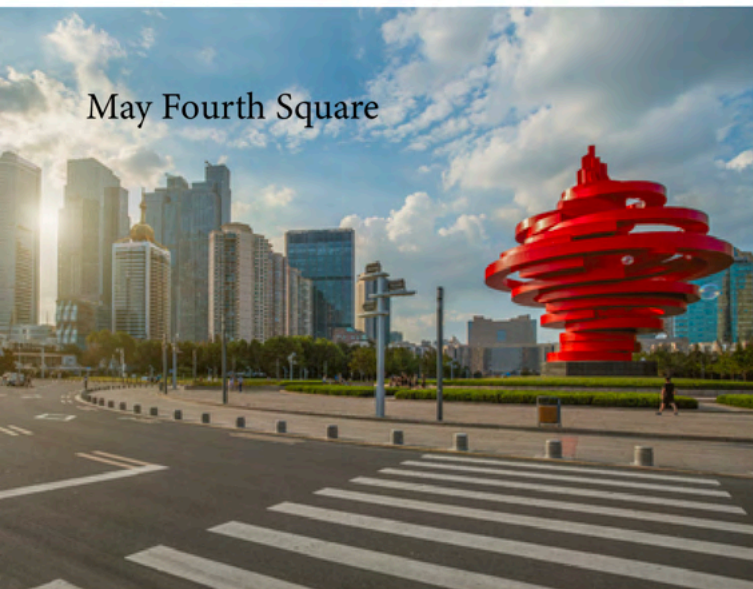
May Fourth Square