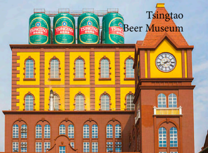
Tsingtao Beer Museum