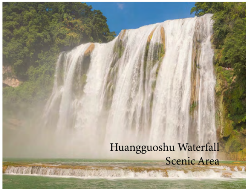
Huangguoshu Waterfall Scenic Area