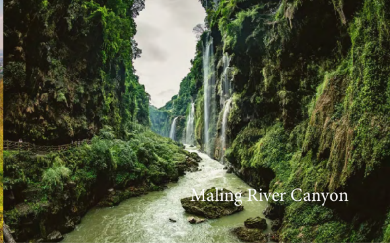
Maling River Canyon