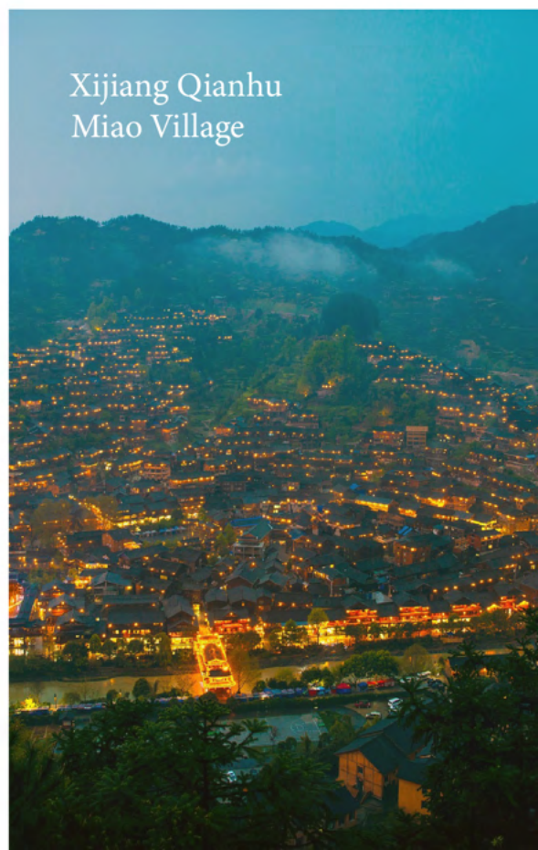
Xijiang Qianhu Miao Village