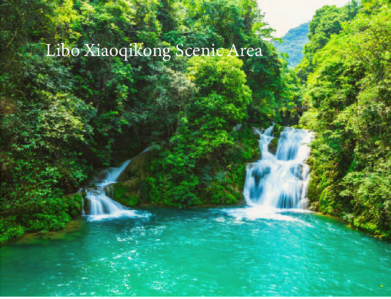
Libo Xiaoqikong Scenic Area