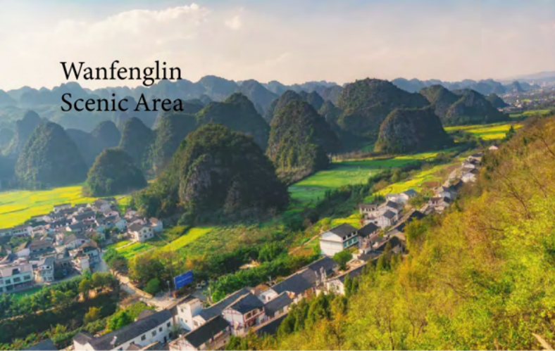
Wanfenglin Scenic Area