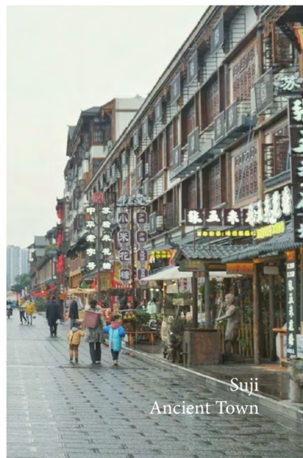
Suji Ancient Town