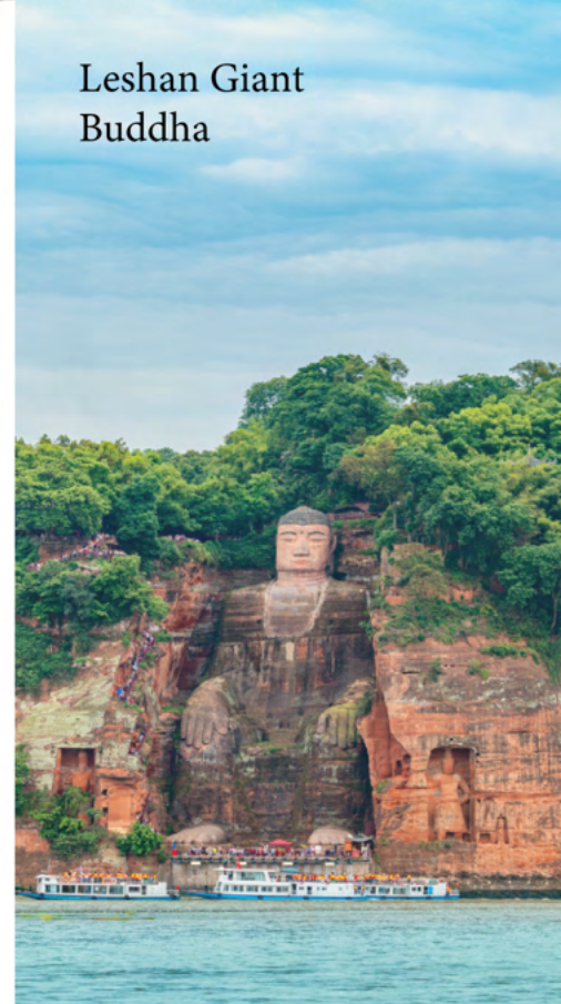
Leshan Giant Buddha