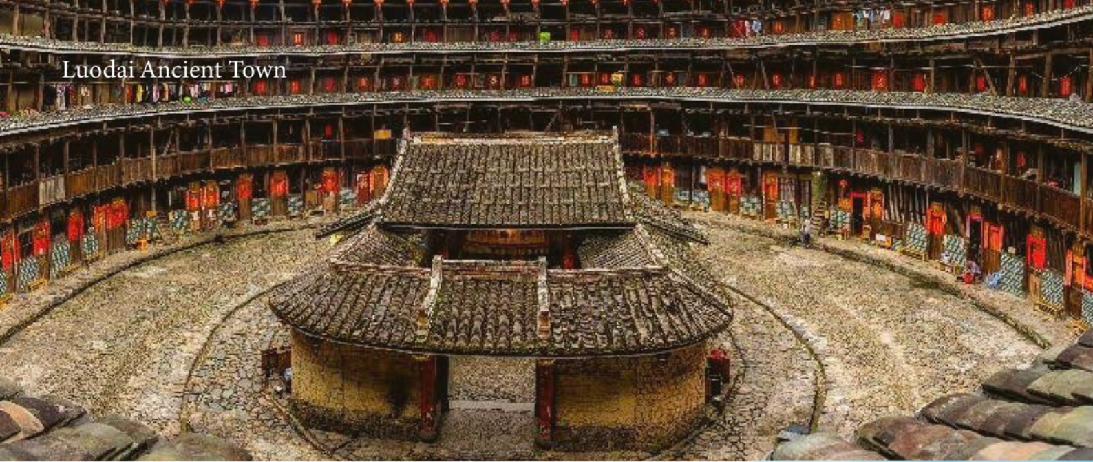
Luodai Ancient Town