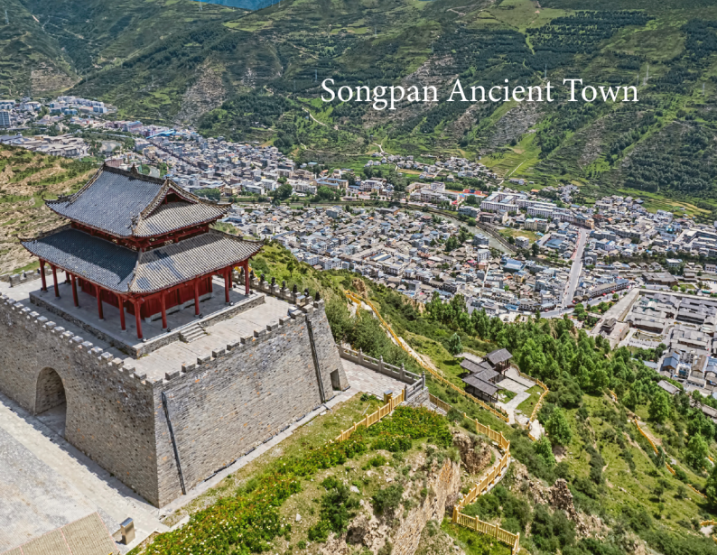
Songpan Ancient Town