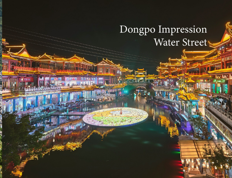
Dongpo Impression Water Street