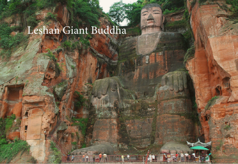
Leshan Giant Buddha