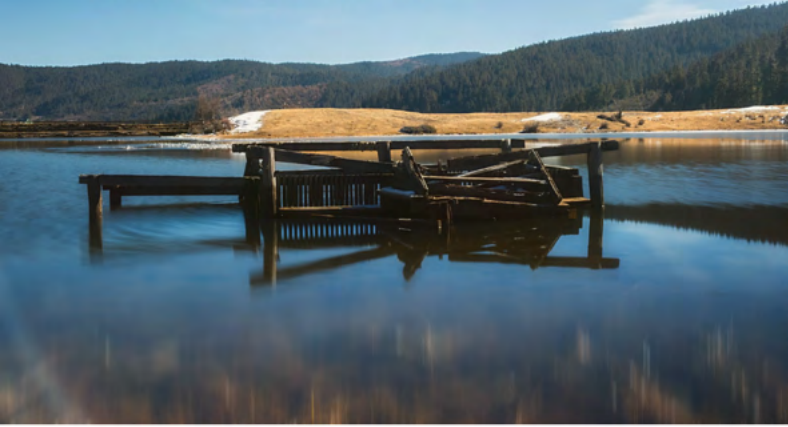
Pudacuo National Park