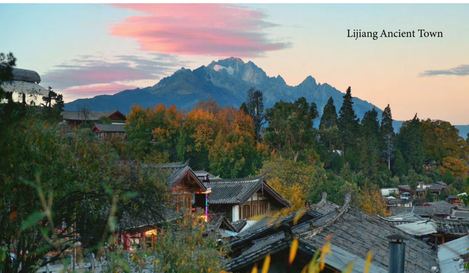
Lijiang Ancient Town

Day 8: Dali – High-Speed Rail – Kunming – Singapore