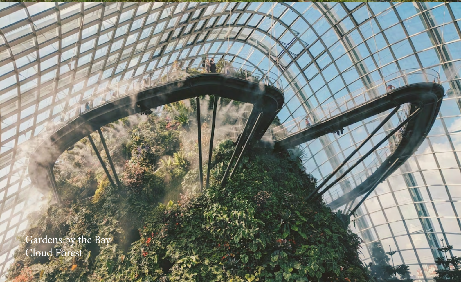
Gardens by the Bay Cloud Forest