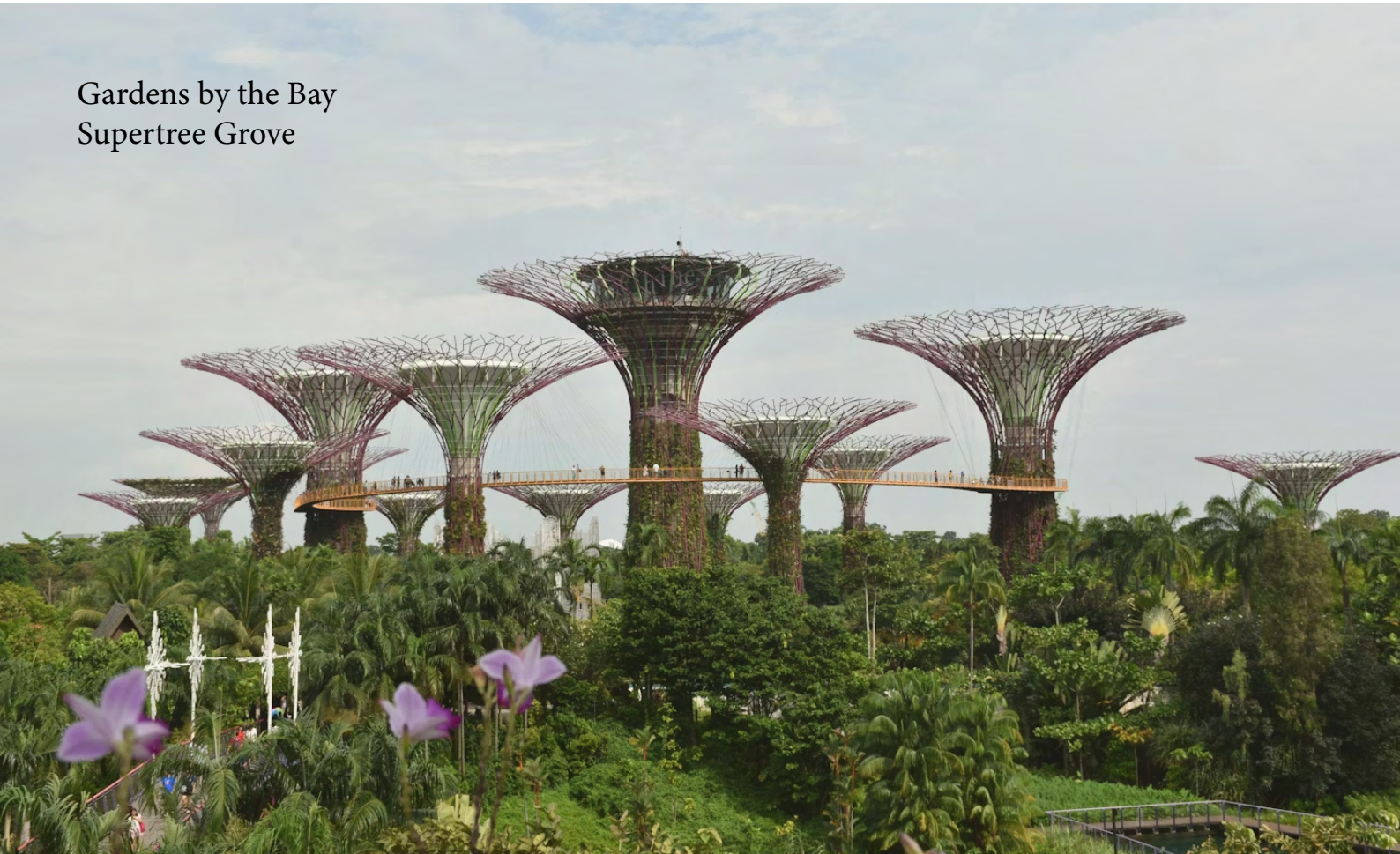
Gardens by the Bay Supertree Grove

Transfer to the airport at the scheduled time, marking the end of your Singapore journey.