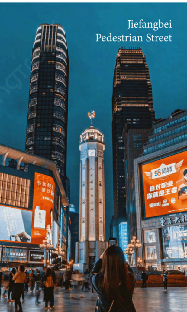
Jiefangbei Pedestrian Street