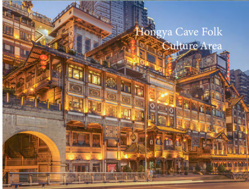
Hongya Cave Folk Culture Area