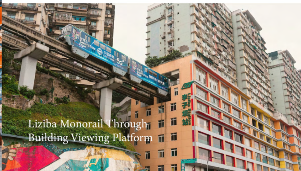
Liziba Monorail Through Building Viewing Platform