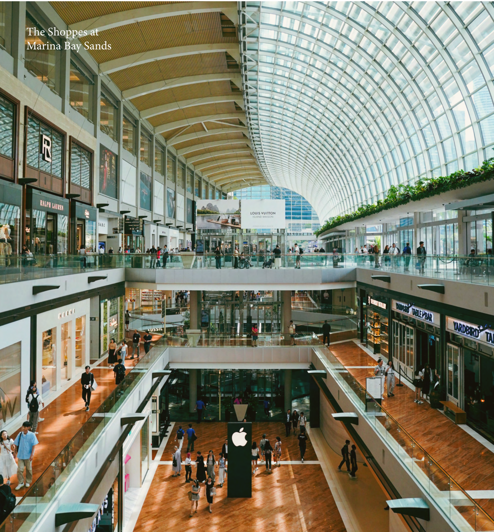
The Shoppes at Marina Bay Sands

End the day with the spectacular Spectra Light & Water Show outside Marina Bay Sands. Enjoy the dazzling blend of music, lights and water effects.