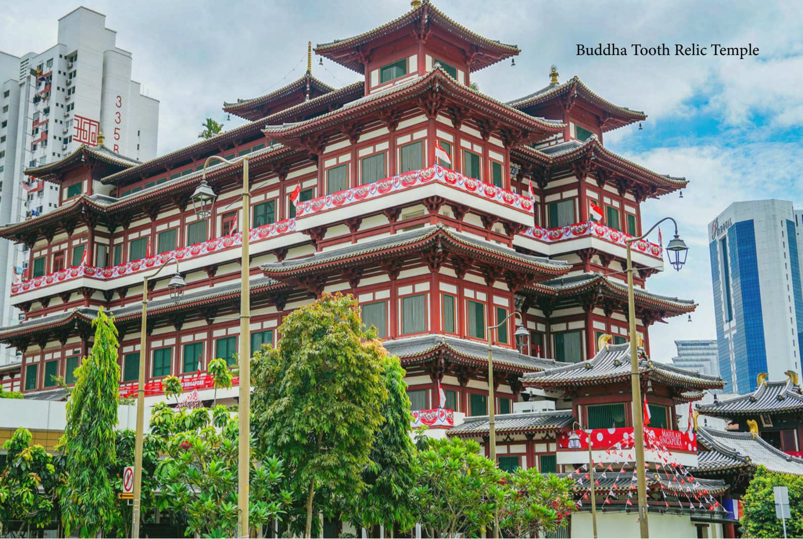
Buddha Tooth Relic Temple